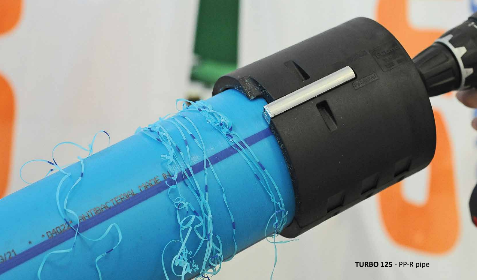
TURBO 125 - PP-R pipe