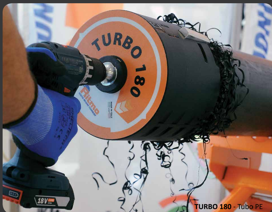
TURBO 180 - Tubo PE

PE e PP pipe Ø 125 mm Scraping depth 100 mm Time: about 20"